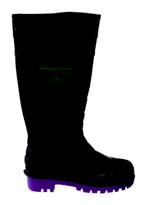
AVAILABLE IN SIZES : 6,7,8,9,10,11,12,13,14.