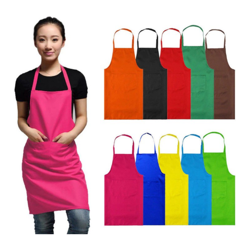
ALL SIZES AVAILABLE