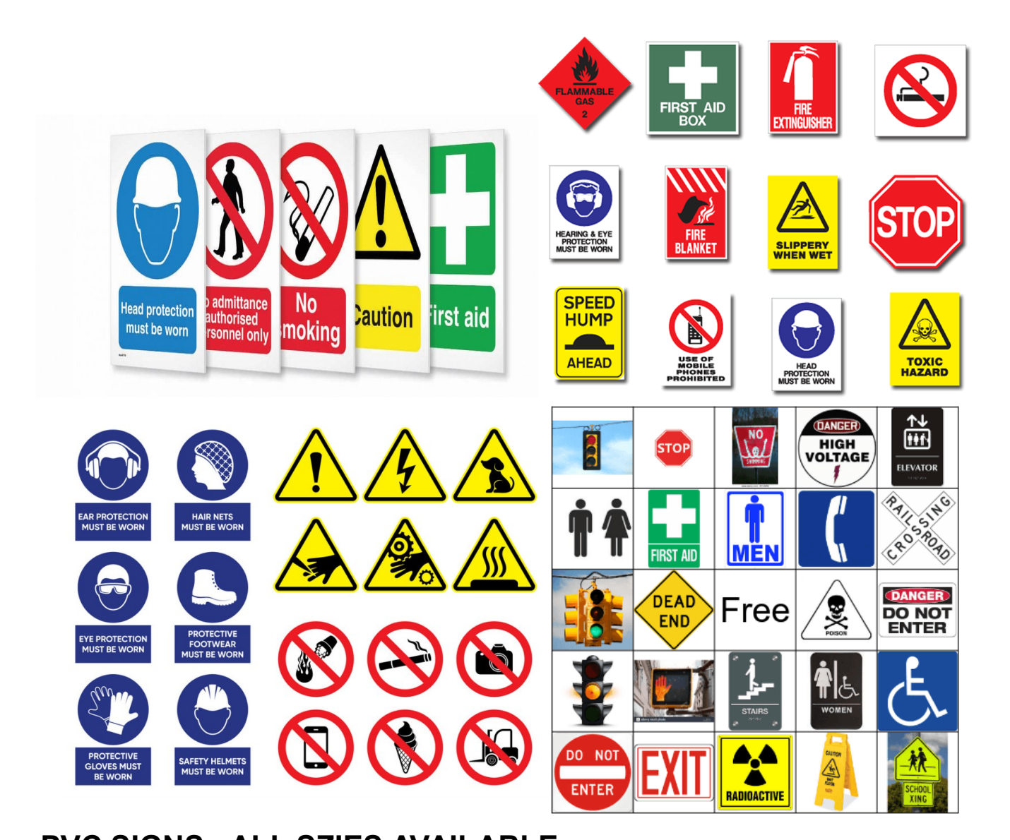
PVC SIGNS –ALL SZIES AVAILABLE